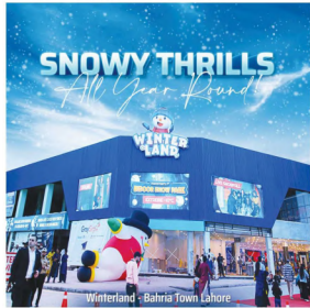
WINTERLAND - Bahria Town Lahore